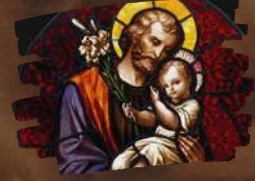
Saint Joseph, husband of the Blessed Virgin Mary - Solemnity 19th March 2025