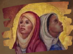
Commemoration of Saints Perpetua and Felicity, Martyrs 7th March 2025