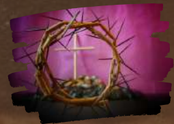
1st Sunday of Lent 9th March 2025