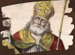
Commemoration of Saint Patrick, Bishop, Missionary 17th March 2025