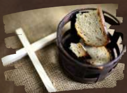
2nd Sunday of Lent 16th March 2025