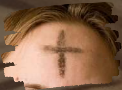
Ash Wednesday 5th March 2025