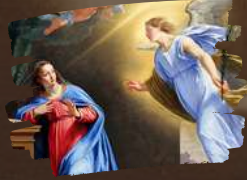
The Annunciation of the Lord - Solemnity 25th March 2025