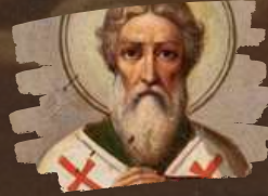
Commemoration of Saint Cyril of Jerusalem, Bishop, Doctor 18th March 2025