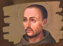
Commemoration of Saint John of God, Religious 8th March 2025