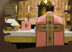
4th Sunday of Lent (Laetare Sunday) 30th March 2025