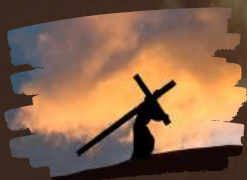
3rd Sunday of Lent 23rd March 2025